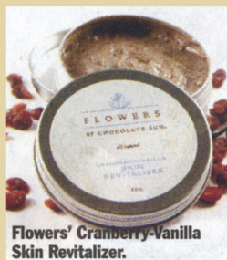
Flowers' Cranberry-Vanilla Skin Revitalizer.